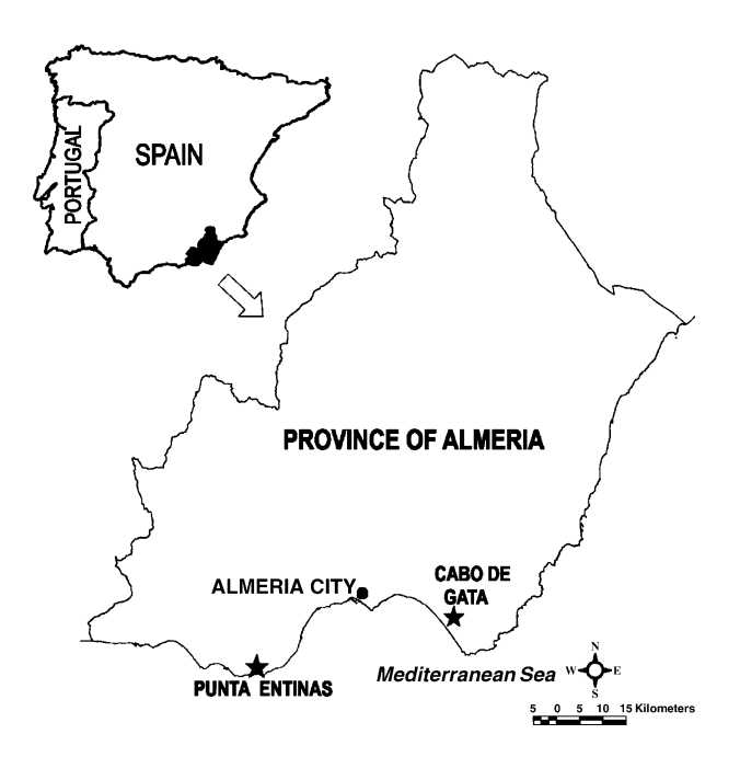
Figure 1 Location of study sites in the Province of Almería, SE Spain. Cabo de Gata Natural Park and Punta Entinas-Sabinar Nature Reserve are shown with stars.

Dunes over clay soils and calcareous hardpans dominate the landscape in Cabo de Gata. The native community is a typical